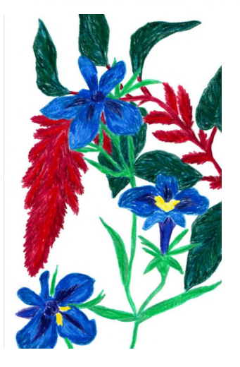
MARIE VERLEY DOZ Les assiettes #1, drawing, 2021